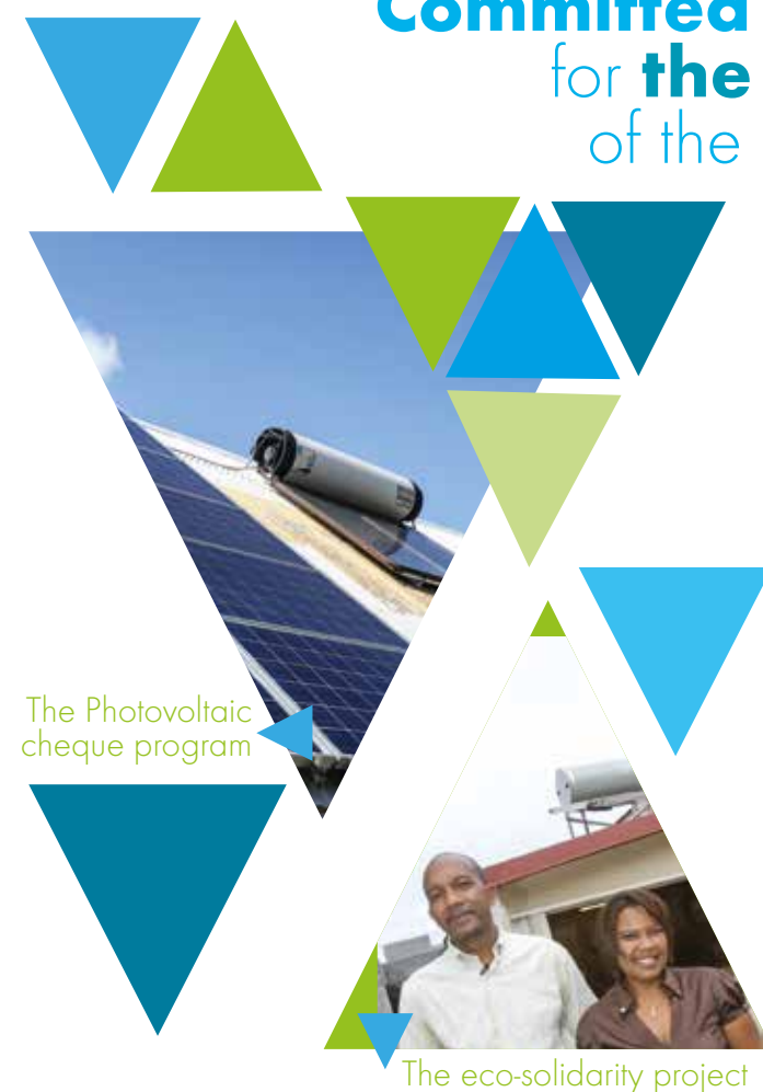
The Photovoltaic cheque program

Committed actors for the future of the Planet